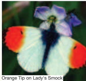
Orange Tip on Lady's Smock