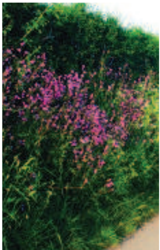
Red Campion and Meadowsweet Verge

Denbighshire verges are noted for their species diversity which is largely determined by the prevailing geology and soils. These have created a variety of grassland habitats across the county. Amongst the most impressive are the calcareous grasslands in the north and east where limestone-loving plants such as Orchids, Meadow Crane's-bill, Field Scabious, Cowslip, Lady's Bedstraw, St John's-wort, Yellow Rattle and numerous other wildflowers occur in great abundance. Elsewhere, verges more typical of unimproved acid grassland of the upland areas and neutral grassland in the lowlands support Greater Stitchwort, Giant Bellflower, Shiny Crane's-bill, Sneezewort, Harebell or Foxglove. Plants more associated with woodland habitats including Bluebell, Primrose and Red Campion are also to be found growing in some verges.