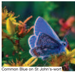
Common Blue on St John's-wort

A low intensity management regime is being trialled to determine the optimum cutting times for different types of grassland and, in so doing, ensure the conservation and protection of the greatest numbers of wildflowers and other associated biodiversity.