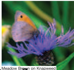
Meadow Brown on Knapweed