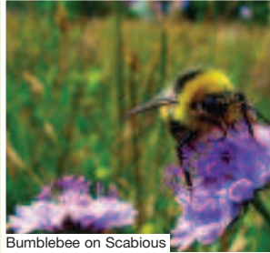
Bumblebee on Scabious